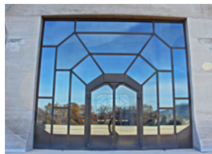
Call for a responsible approach to the earth: the world is reflected in the Goetheanum

A second impulse concerns the cooperation between the Sections, the promotion of the Anthroposophical Society and public relations – areas where the Goetheanum Leadership would like to see a more clear-cut definition of its tasks. As a body, it represents the School of Spiritual Science within the General Anthroposophical Society and is responsible for its development. It tries to set future impulses and to carry out, and inspire, research. In order to make sure that these aims are achieved and as a way of examining its own ways of working,