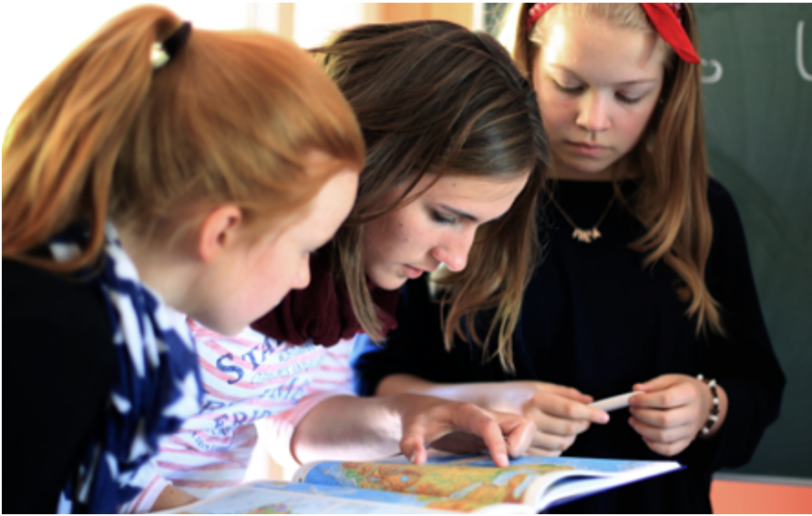
Enlivening the teaching out of the encounter with the students