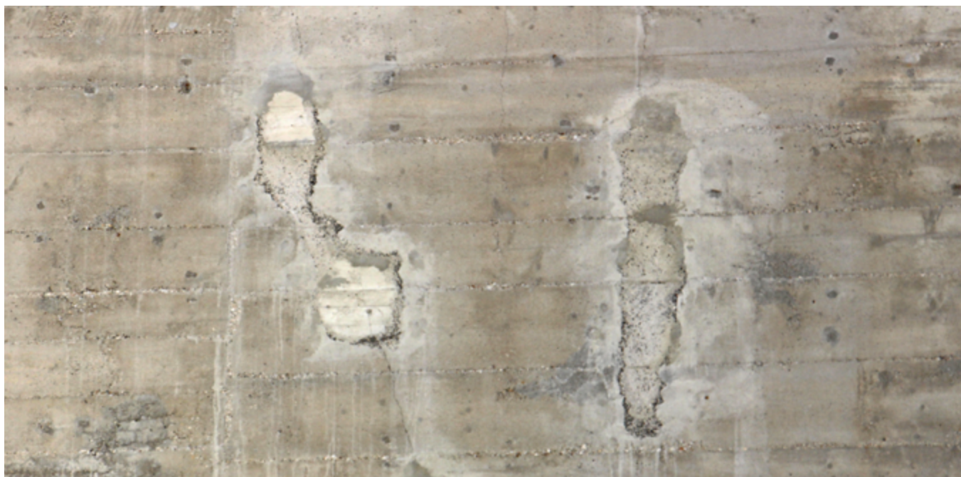
Open for encounters: the relationship of forms in the Goetheanum's Southern façade.