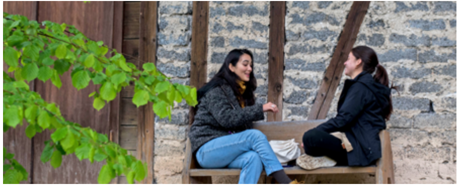
Young people find out what young people want (taken at the 2017 students' conference)