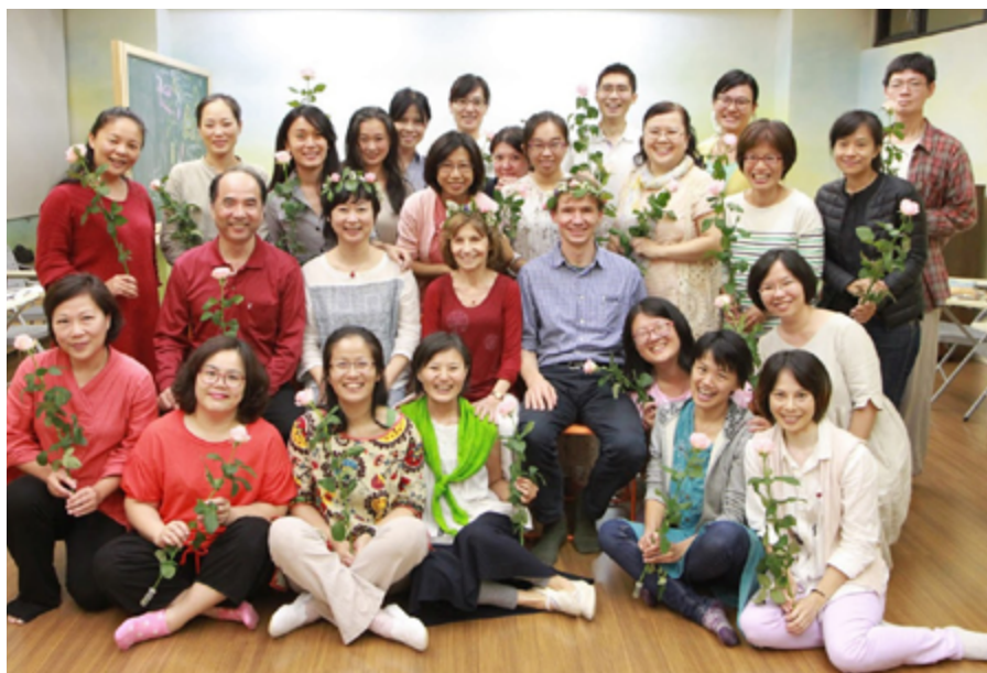
Celebrating the completion of the three-year Rhythmic Massage training in Taiwan