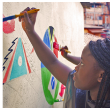
Young participants at the World Social Initiative Forum in Brazil: establishing a relationship with one's own culture

A feeling of liberation was the consequence. Because there is something like a colonization complex: Brazilians often feel that everything that comes from outside is better than what they have themselves. But Brazil has a particularly rich mythology! Most Brazilians have African roots, but they either don't know or don't appreciate them, although they are so precious. We can make