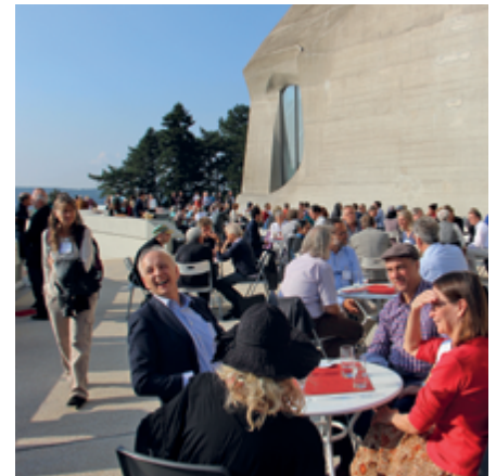
The Members' Conference: a place for meetings and conversations (2016 Goetheanum World Conference)

We would then like to continue our work on the Foundation Stone Meditation, focusing on the second verse. This verse links the human 'I' with the periphery: with the «I of the World». By looking more closely at «true feeling», the «surging deeds of Worlds» and the working of the Christ we will touch on today's spiritual questions. The effective-