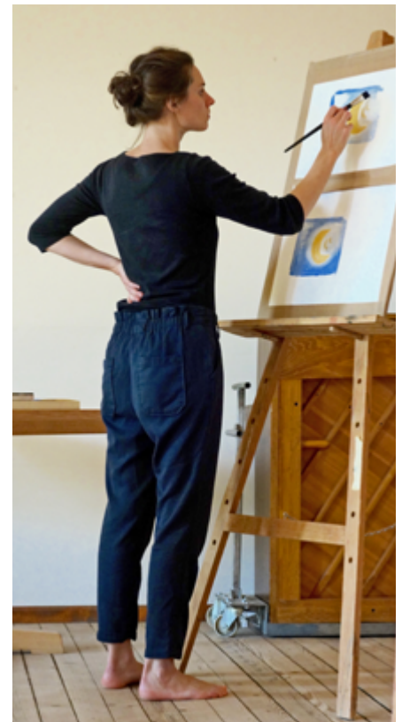
In the Painters' Workshop