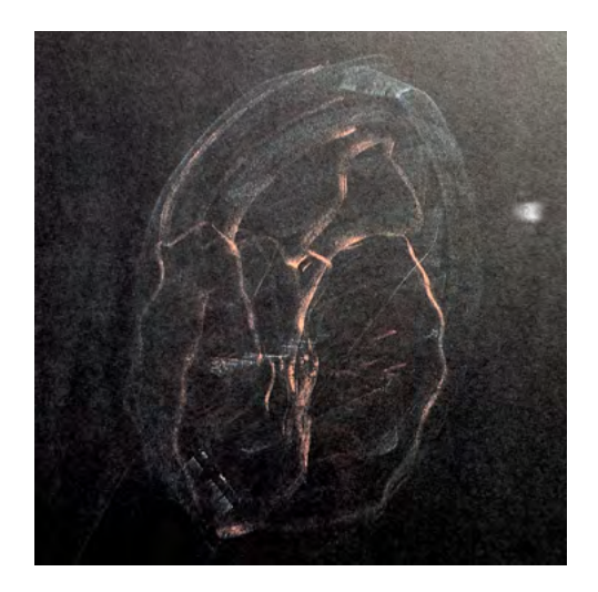
General Anthroposophical Society