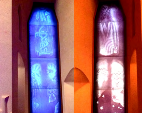
General Anthroposophical Section

Web www.soulofeurope2019.eu Image New impulses arising from an existing network