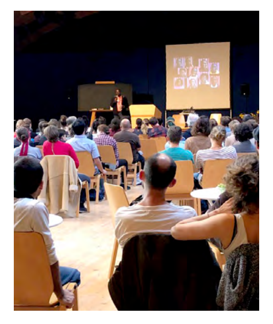
Section for Social Sciences