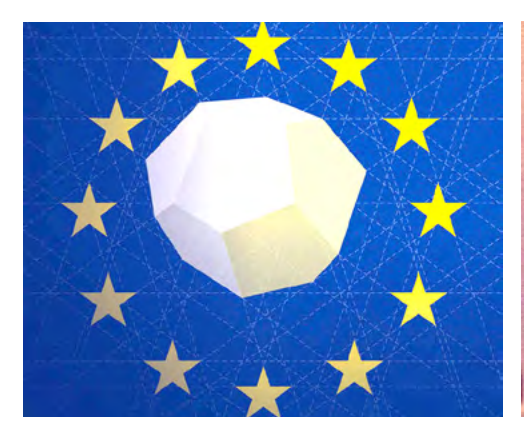
Section for Social Sciences et al.