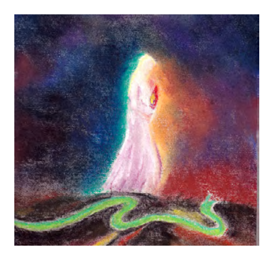
Humanities Section Great Britain